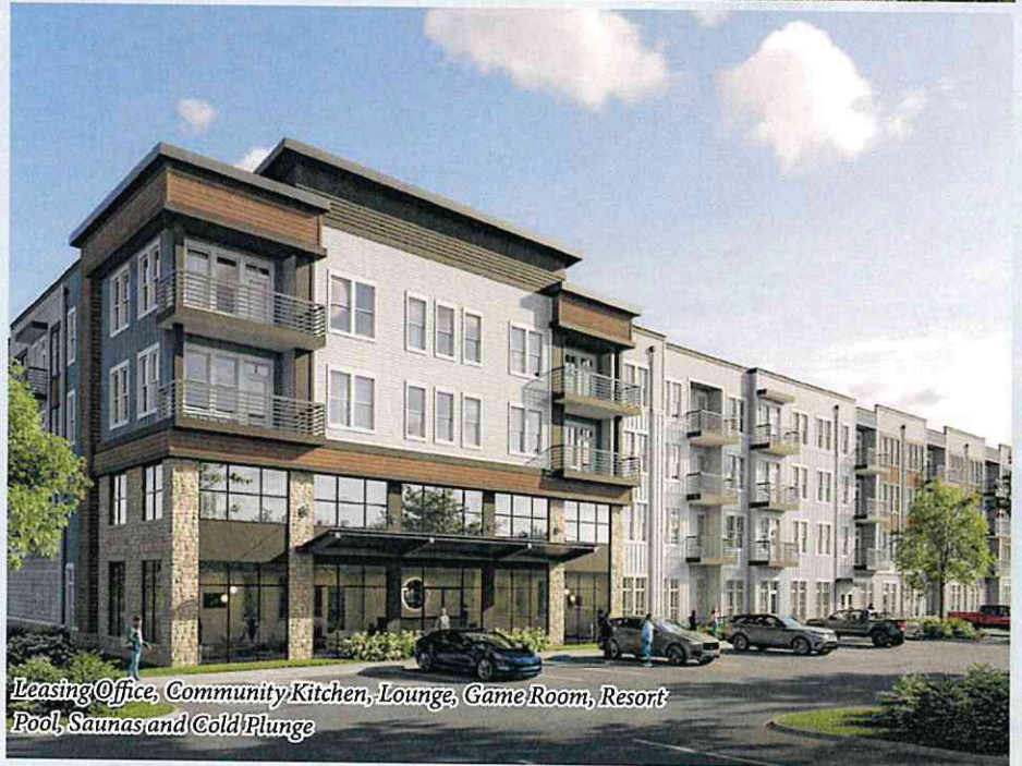
Leasing Office, Community Kitchen, Lounge, Game Room, Resort Pool, Saunas and Cold Plunge

tive part of construction, paving the way for wellness to be considered in today's projects.