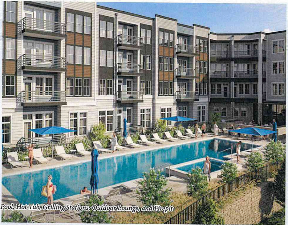
Pool, Hot-Tub, Grilling Stations, Outdoor Lounge, and Firepit

The wellness approach goes hand-in-hand with green building principles. Environmental sustainability standards emerged in 1990, but today are a norma-