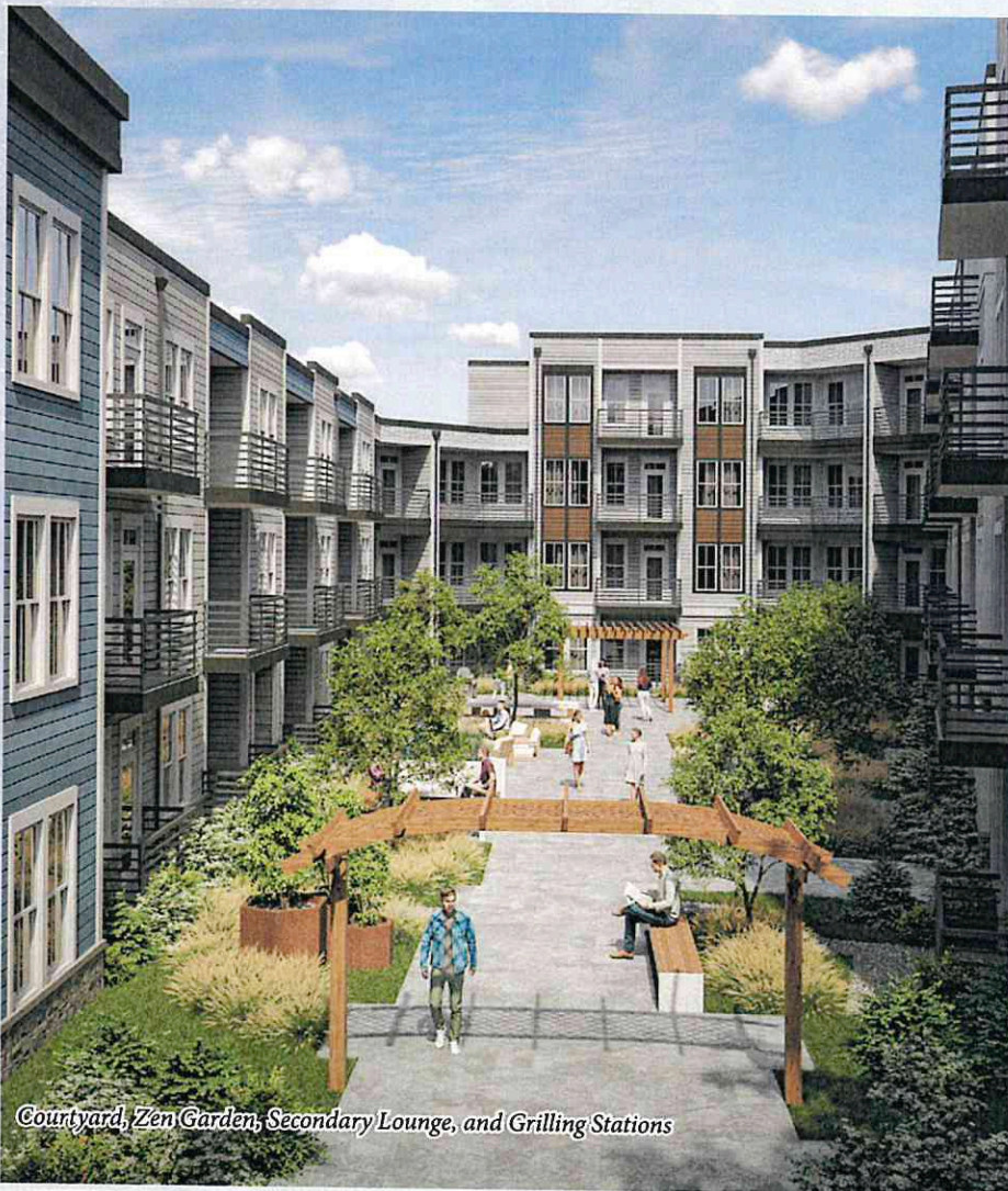
Courtyard, Zen Garden, Secondary Lounge, and Grilling Stations

Building Council, LEED certification is very nearly mainstreamed. It includes standards in carbon, energy, water, waste, transportation, materials, health, and indoor environmental quality. Those elements are closely aligned with health and are considered in a wellness real estate project.